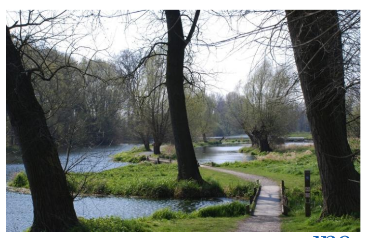
The Tortoise - Le Parc de la Deûle

and develop access and recreation associated with the river. So they re-profiled the river, created backwaters and addressed the water quality issues. They also improve the access to the site and the river. He discussed benefits such as natural water treatment, flood risk management, recreation activities such as walking and fishing but also much more diverse habitats. Where previously they had no waterfowl now the ducks were enjoying themselves!